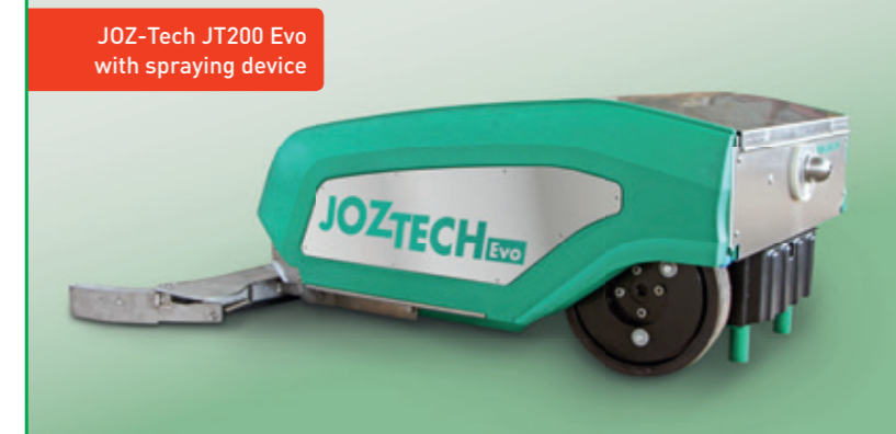
JOZ-Tech JT200 Evo with spraying device