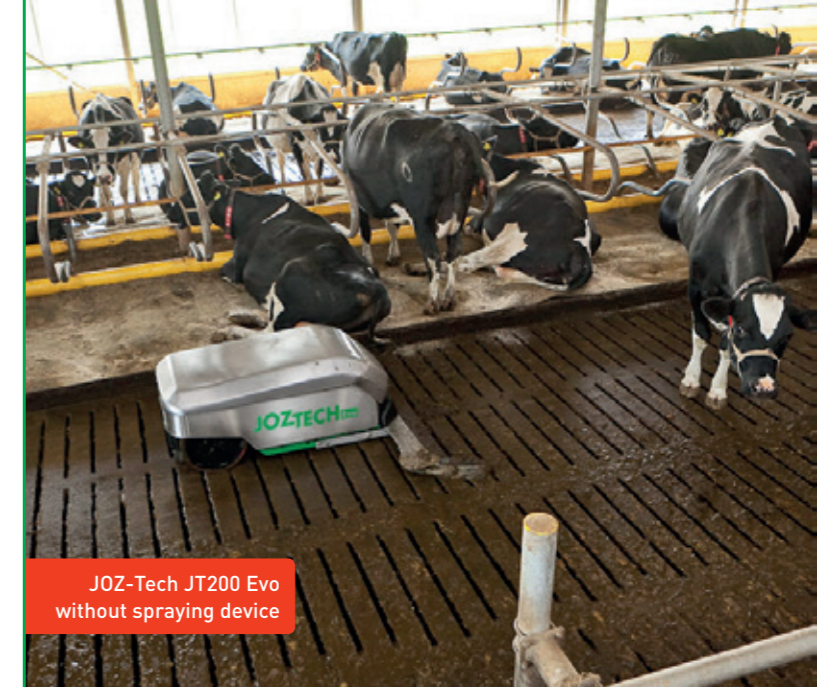
JOZ-Tech JT200 Evo without spraying device