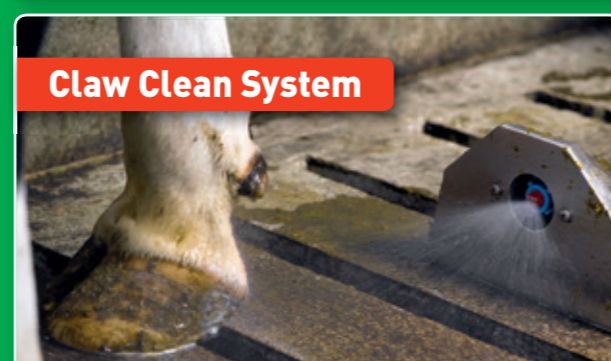
Claw Clean System